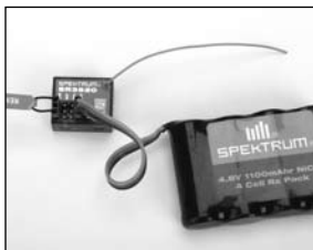
Powering the receiver with a separate receiver pack