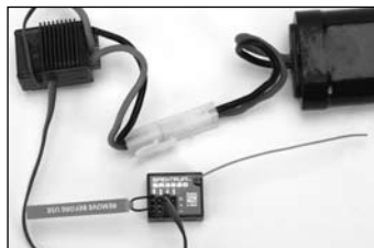
Powering the receiver with an ESC